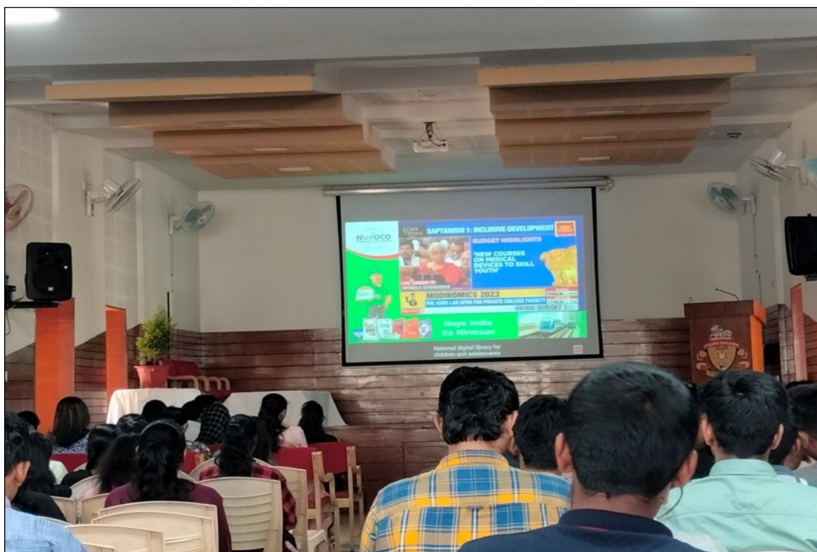
Students and Staff watching Live Telecast of Union Budget 2022-23 Poster of Live Telecast on Union Budget 2023-24

To conclude students presented their opinions on the budget. And showed their analytical skills in understanding of economic parameters on which the budget has its impact and scrutinized the road map chartered out by the Hon'ble Finance Minister during his speech on the budget.